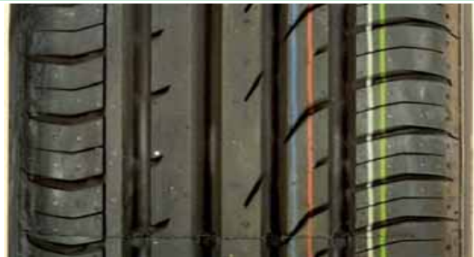
CONTINENTAL CONTI PREMIUM CONTACT 2