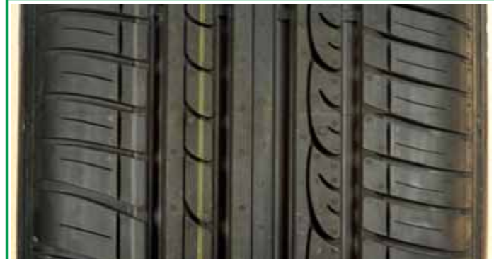
DUNLOP SP SPORT FAST RESPONSE