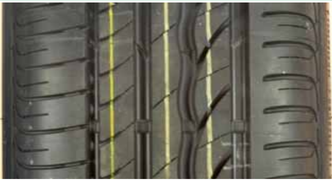
BRIDGESTONE TURANZA ER300