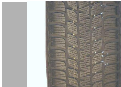
BRIDGESTONE BLIZZAK LM25