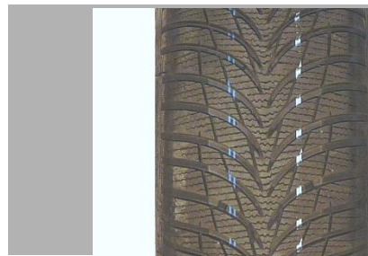
GOODYEAR ULTRAGRIP 7+