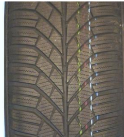
CONTI WINTERCONTACT TS 830