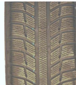
MICHELIN PRIMACY ALPIN PA3