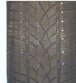
DUNLOP SP WINTERSPORT 3D